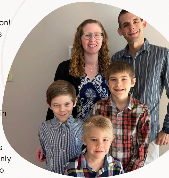
The Gulya Family