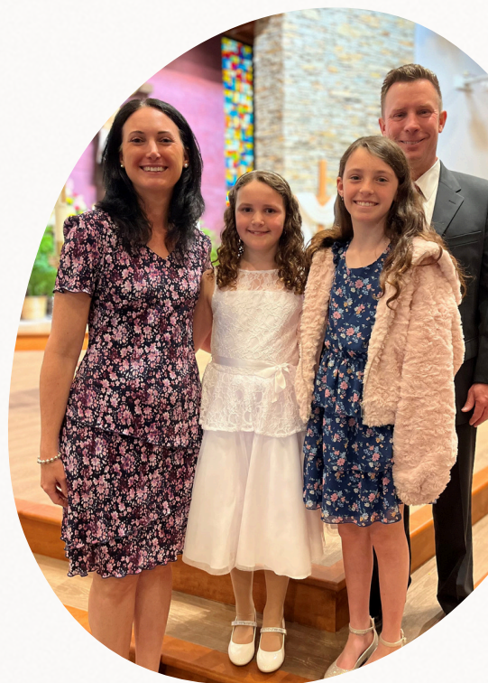
The Houser Family